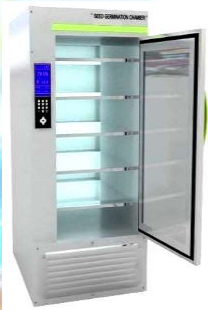
SEED GERMINATOR CHAMBER