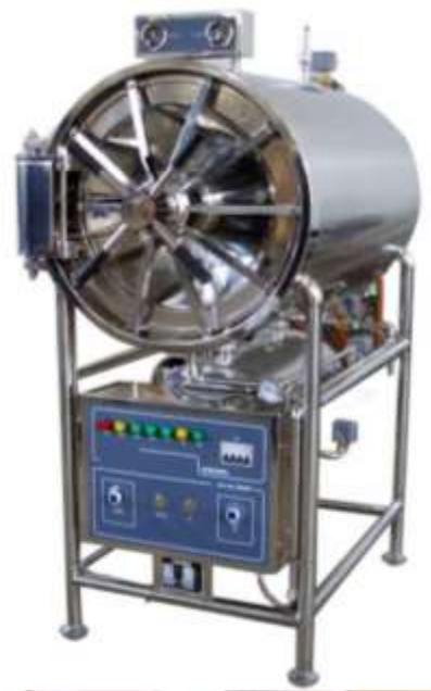
AUTOCLAVE HORIZONTAL CYLINDRICAL