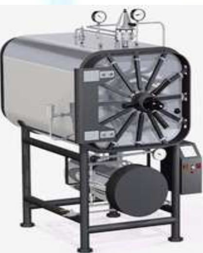
Autoclave Horizontal Rectangular