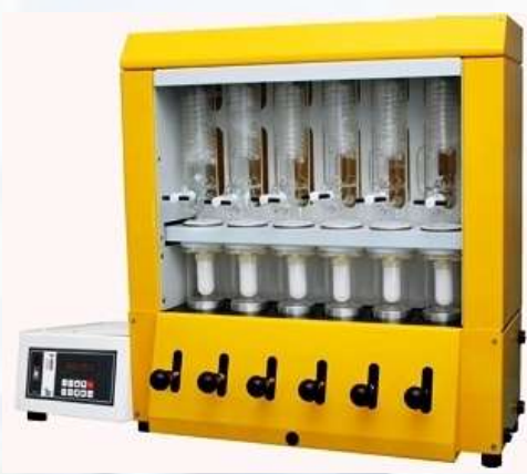
GLASS WARE DRYER